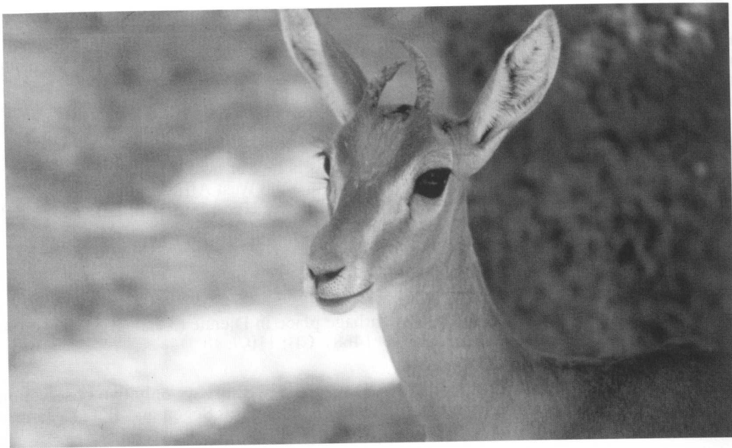
Fig. 2: Gazella rufifrons , female from Bandiagara.

The species lives in the isolated soft-sand-belt southeast of the Falaise de Bandiagara (Teli, 29 December 1993, no. 1465; Tireli, 12 February 1995, no. 1787). Up to now it was known only from the North of Mali (Musser & Carleton 1993). On the leeward side of the Falaise, sand from the northwind Harmattan falls down and forms a narrow band of soft-sand-dunes of 50–200 m in diameter close to the cliffs. This is the only suitable habitat for the sand-dwelling species in the area. Measurements (no. 1465 ♂, 1787 ♀): HB: 93, 90; T: 106, 110; HF: 24.3, 22.3; E: 13.8, 14.0; CB: —, 25.1.