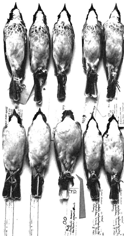
Whitebrowed Sparrow-Weaver Plocepasser mahali

Ventral views of five races of P. mahali to show variation in ground colour and the presence or absence of breast spotting.