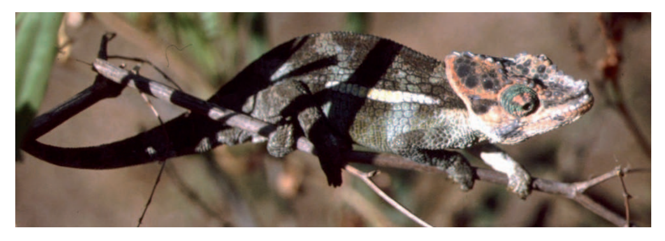
Fig. 6. Holotype of K. u. artytor ssp. n. in life.

species have been described from montane forests in Kenya and Tanzania (Menegon et al. 2009, Necas 2009, Necas et al. 2009) and several subspecies have also been raised to species status based on genetic divergence and detailed morphological studies (Mariaux et al. 2008). No doubt more species remain to be discovered in the still poorly surveyed mountain ranges across East Africa. The discovery of K. uthmoelleri in the South Pare Mountains also shows that species' distribution ranges are not well documented and it is quite likely that K. uthmoelleri also occurs on other massifs in-between these now known populations, such as Mt. Kilimanjaro and Mt. Meru (Fig. 8). K. uthmoelleri has a similar distribution to the Trioceros sternfeldi species complex, including the recently described T. hanangensis (Krause & Böhme 2010). Although the phylogeography of all T. sternfeldi populations has not been investigated, the Mt. Hanang population has been identified as a divergent sister clade to the Mt. Meru/ Kilimanjaro populations. A similar pattern is found in K. uthmoelleri, the Mt. Hanang populations morphologically di-