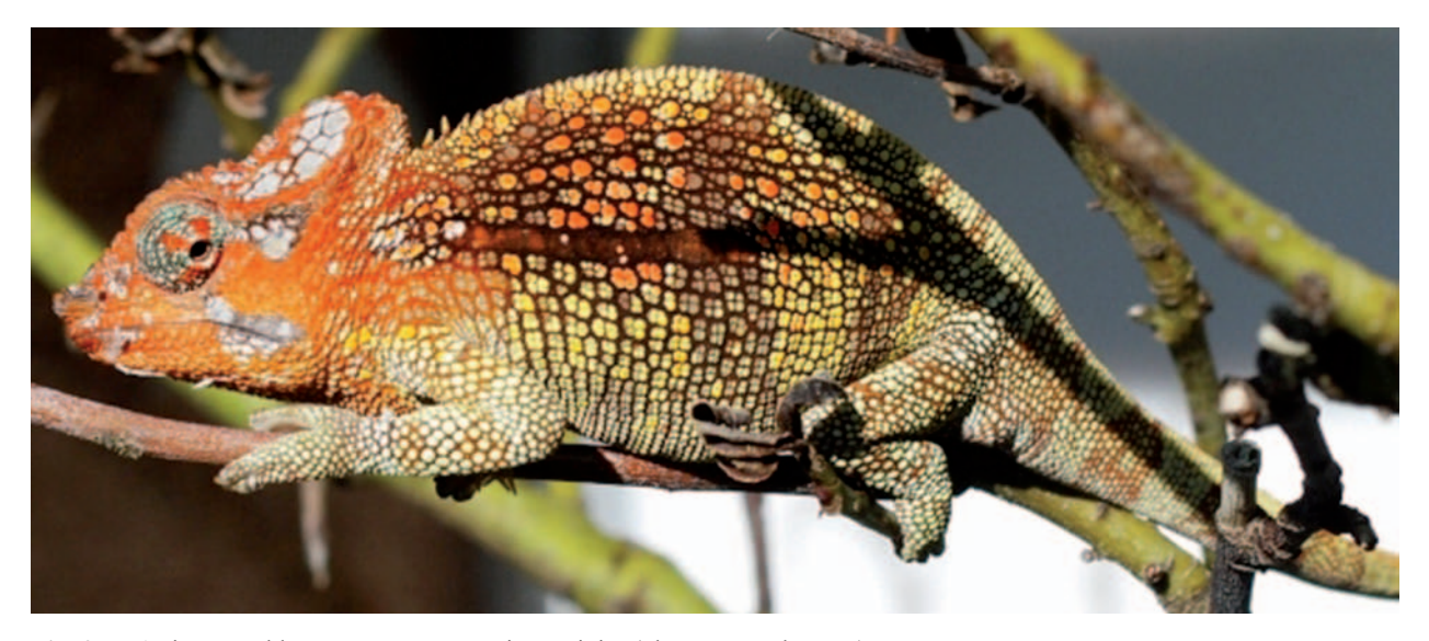
Fig. 9. A six year old K. u. artytor ssp. n. in captivity.