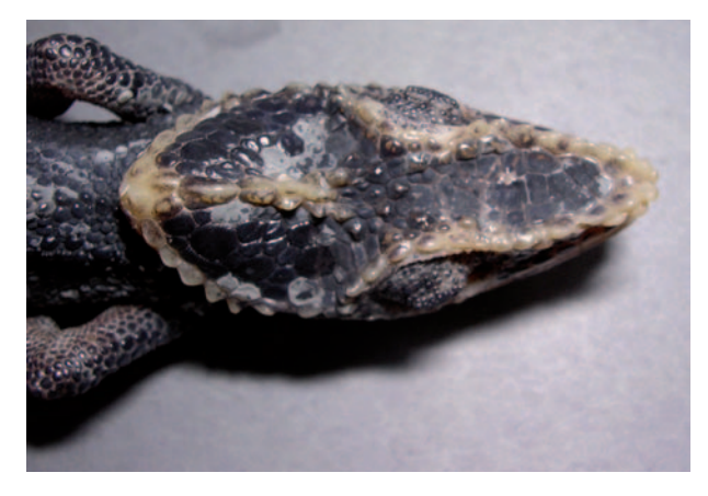
Fig. 1. Head view of the holotype of K. u. uthmoelleri.

moelleri at these locations have not been confirmed. Recently the taxon uthmoelleri was placed with all other east African Bradypodion in a new genus, Kinyongia (Tilbury et al. 2006). In the last 15 years only two authors have published details on the captive husbandry and breeding of K. uthmoelleri, specimens collected from the Ngorongoro crater highlands (Price 1996; Necas & Nagy 2009). Around the year 2000, specimens of "Bradypodion uthmoelleri" appeared in the international pet trade. These animals were very small in overall size, more slender and with smoother scalation than K. uthmoelleri specimens from Mt. Hanang. Even after six years of keeping some of these specimens in captivity these distinct characters have not changed and so ontogenetic change in these characters can be ruled out. Unfortunately, the geographic origin of these specimens was not known until four similar specimens were discovered in the collection of the Muséum d'histoire naturelle in Geneva in 2004, which suggests they originate from the same locality, the South Pare Mountains, and belong to the new subspecies described in this paper.