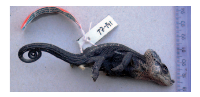
Fig. 3. Holotype of K. u. artytor ssp. n..

1). The females show the same differences between both populations except that the females from the Mt. Hanang population show also a fan-shaped cp anteriorly, instead of no furcation at all in the females from the South Pare Mountains and Ngorongoro highlands. Additionally, the Mt. Hanang specimens are sexually dimorphic in tail length relative to body length (males having relatively longer tails than females), whereas relative tail length between the sexes of specimens from the South Pare Mountains and Ngorongoro highlands specimens is more or less the same. Based on these key characters that differentiate the two groups, we describe the populations from the South Pare Mountains and the Ngorongoro crater highlands as a new subspecific taxon.