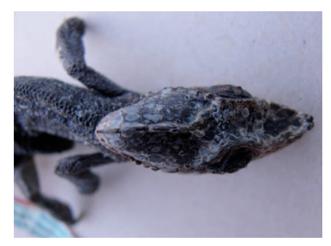
Fig. 5. Head view of the holotype of K. u. artytor ssp. n..

noon. In spring and autumn the cages were sprinkled with water four times per day (in midsummer 6 times) for up to four minutes in the hottest time of the day. During the winter the terrariums were illuminated with common terrarium-tubes (T5 with 35 W) 13 hours per day. A halogen spot was activated for 45 minutes three times per day for basking, so that the ambient temperature stayed between 22 and 24 °C at day time and between 6 and 16 °C at night time. The terrariums were completely sprinkled with water in the morning and evening. The diet consisted of small arthropods, mainly self-bred crickets, grasshoppers, flies, cockroaches etc. Every second feeding the food was enriched with vitamins and minerals. Only pregnant females were additionally given small pieces of cuttlebone. To trigger mating behaviour, the males were transferred into the cages of the females. Immediately, the males started head bobbing and displayed bright colours.