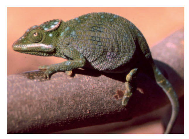
Fig. 7. Female paratype of K. u. artytor ssp. n. in life.

species have been described from montane forests in Kenya and Tanzania (Menegon et al. 2009, Necas 2009, Necas et al. 2009) and several subspecies have also been raised to species status based on genetic divergence and detailed morphological studies (Mariaux et al. 2008). No doubt more species remain to be discovered in the still poorly surveyed mountain ranges across East Africa. The discovery of K. uthmoelleri in the South Pare Mountains also shows that species' distribution ranges are not well documented and it is quite likely that K. uthmoelleri also occurs on other massifs in-between these now known populations, such as Mt. Kilimanjaro and Mt. Meru (Fig. 8). K. uthmoelleri has a similar distribution to the Trioceros sternfeldi species complex, including the recently described T. hanangensis (Krause & Böhme 2010). Although the phylogeography of all T. sternfeldi populations has not been investigated, the Mt. Hanang population has been identified as a divergent sister clade to the Mt. Meru/ Kilimanjaro populations. A similar pattern is found in K. uthmoelleri, the Mt. Hanang populations morphologically di-