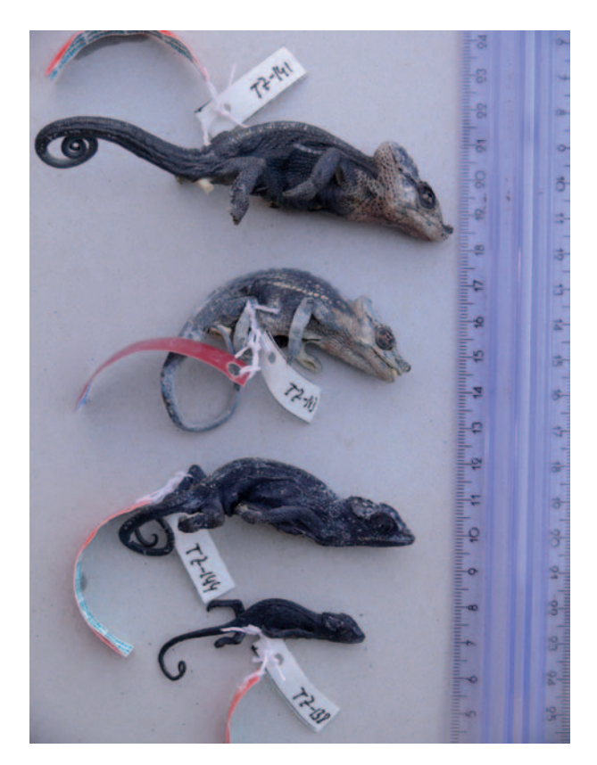
Fig. 2. Type material of K. u. artytor ssp. n..

All measurements and investigated morphological characters of the specimens are listed in Tables 1–3. The morphological traits which differentiate the male specimens of Mt. Hanang from those of the South Pare Mountains and Ngorongoro crater highlands are: higher measurements, a relatively broader and shorter head, rougher (more convex) scalation on the head and body, canthus parietalis (cp) not bi-forked anteriorly but fan-shaped anteriorly and the cp composed of two rows of scales (Fig.