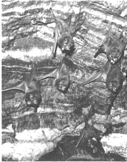
Fig. 2: Group of adult Peropteryx kappleri roosting on a concave mine wall. The open wings are a sign of alertness, indicating readiness to fly.

found not to be at her roosting site on seven occasions). She also gave birth and reared her young in the same site at the back of the mine.