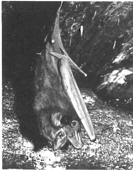
Fig. 1: Adult male Peropteryx kappleri roosting during the day in mine #6, showing the individual marking system with colored plastic rings.

Daily activity patterns inside the mines were studied by direct observation using a head lantern. For this purpose a black plastic blind was hung along one end of the cave corridor with a hole in the upper portion where the observer could stand without disturbing the bats. Records of sex, weight and arm length were taken during each visit. Caves were visited on a weekly basis and daily during the reproductive period. Notes on climate were also taken.