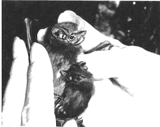
Fig. 4: Female of Peropteryx kappleri with her approximately eight-day-old young clinging tightly while nursing.

eighth day while the mother was absent at night. During the day, the mother normally escaped with the young firmly attached if disturbed (Fig. 4). The vocalizations of the young were more clearly defined. After twenty days the young could reach up to two meters in each flying jump; the abdomen presented little hair but the skin was darker. After thirty days the mothers still carried the juveniles to nurse; if disturbed the mother carried the young or it followed the mother, flying to another place. After